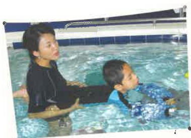
俯臥水面鍛鍊背部肌肉 Lying on the front to train back muscle.