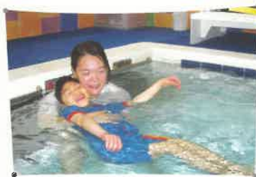
於水中進行被動式伸展 Doing passive stretching in the water.