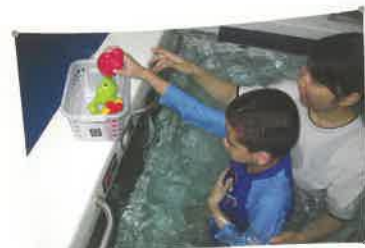
水中企立無難度！ It's so easy to stand in the water!

物理治療的水療訓練是指透過各種水中運動去伸展、放鬆及強化肌肉、骨骼和活動關節。在水中運動不但可以鍛鍊心肺功能，強健體魄，增強抵抗力，同時可以紓緩精神緊張及生活壓力，持續有系統的訓練甚至可有減肥效用。