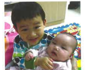
哥哥與妹妹 brother and sister