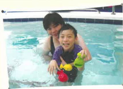
水療都係我哋的親子時間! Hydrotherapy enhances our relationship.

However, not all students who need to receive physiotherapy are suitable to have hydrotherapy treatment. Only those who undergo comprehensive evaluation by physiotherapist and are diagnosed to be fit for the treatment can proceed. Some students who are limited by their ability in land exercises could find better manoeuvre in the water, hence greater sense of achievement and confidence in the treatment. Physiotherapist could treat students in accordance with their conditions, so as to improve their body control, balance, cardio-pulmonary function, flexibility and walking ability etc.