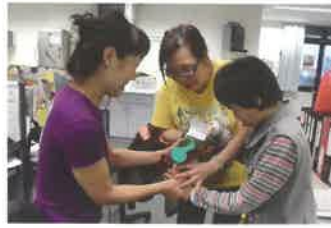
速遞員殷勤地送上飲品，老師多受落！ Our courier gives a drink to teacher courteously.

Students of SEC prepare drinks and deliver them to customers in the campus since April. Customers offer tips and verbal encouragement to students to boost up their self confidence and social skills. The programme will run till summer holiday and students will donate part of the proceeds to SEC. The rest will be given to their parents to demonstrate their roles as adult and family member.