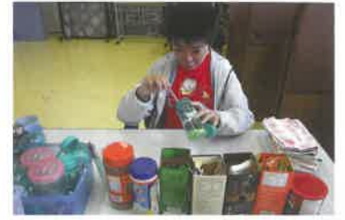
多謝大家落單，茶水部至有工開。看看我們的學員多勤奮！

Thank you for your support to keep the tuck shop running. See how diligent our student is!